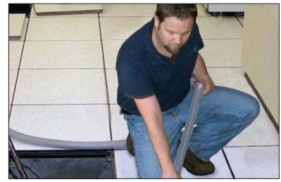
Cleaning Services for Subfloors