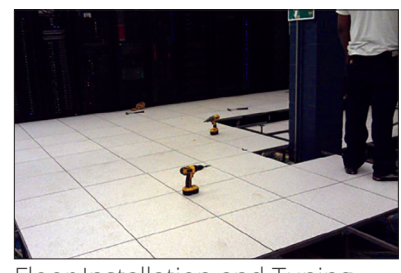
Floor Installation and Tuning