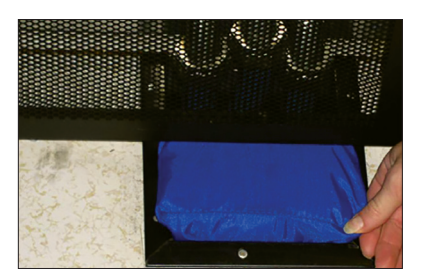
Custom Floor Grommets

Soft strip, hardwalls, drop down ceilings and sliding doors all customized to ensure optimal cooling and minimum energy usage