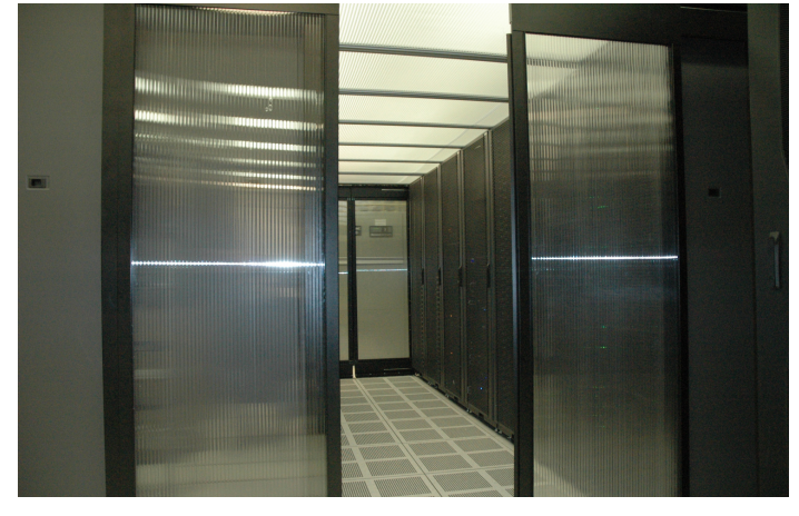
Site #4 Cold Aisle Containment with PolarPlex Drop-Away Panels and Auto-closing Sliding Doors.