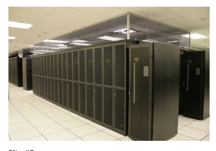
Site #2 Cold Aisle Containment with PolarPlex rigid, vertical panels made of FM4910 compliant clear CPVC. Sliding Doors at aisle ends set inside the RPPs.